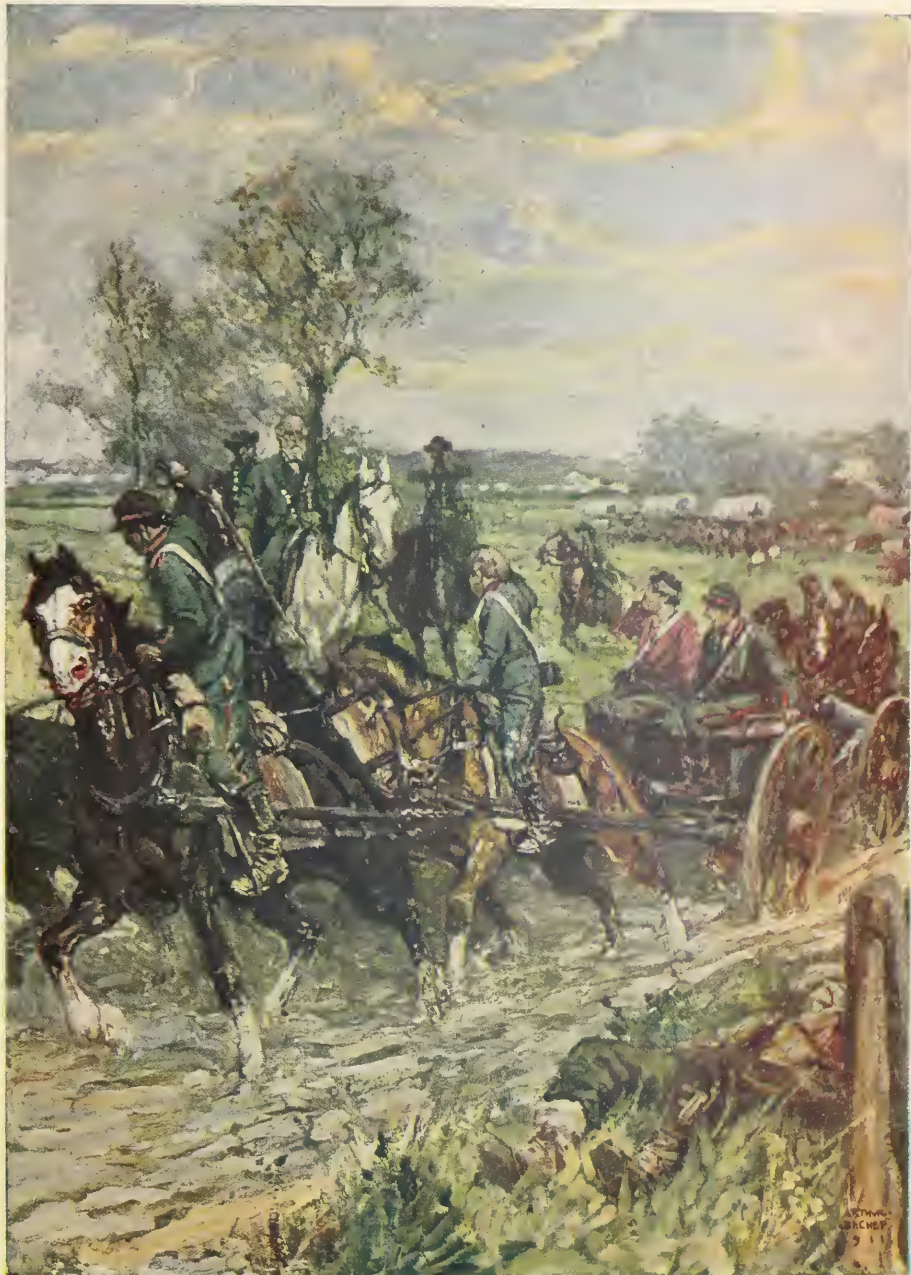
LEE SENDING THE ROCKBRIDGE BATTERY INTO ACTION FOR THE SECOND TIME AT ANTIETAM OR SHARPSBURG.